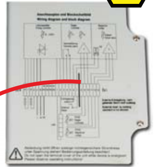
Cover with connection diagram

Separation of intrinsically safe circuit (Ex i)