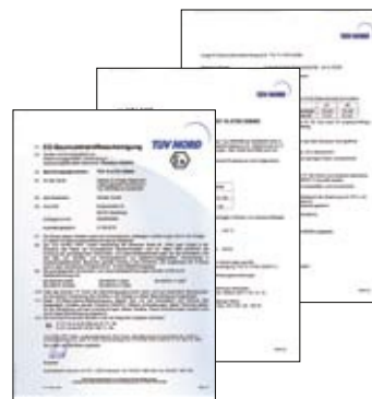
EC-Type examination certificate